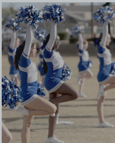
Cheerleading Dec 15th & 16th 3:15 – 5:00 p.m.