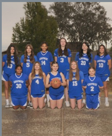
Girls Basketball Dec 16th, 17th & 18th 3:15 – 5:00 p.m.