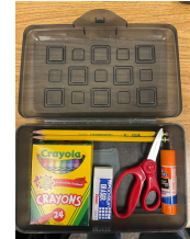
Pencil Box Example