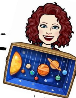
Meet Your Teachers